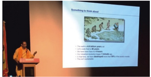
It is a compulsory course which includes topics like life style management, study management, time management and human excellence.