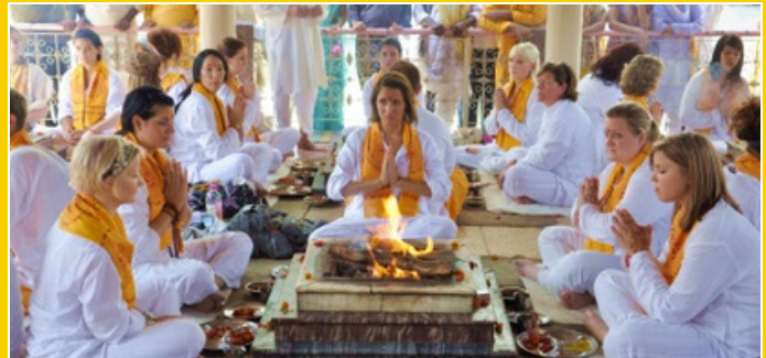
Reviving the Vedic Culture of Yagya to harmonize the ecological balance, purify the gross and the subliminal environment of Nature and life.