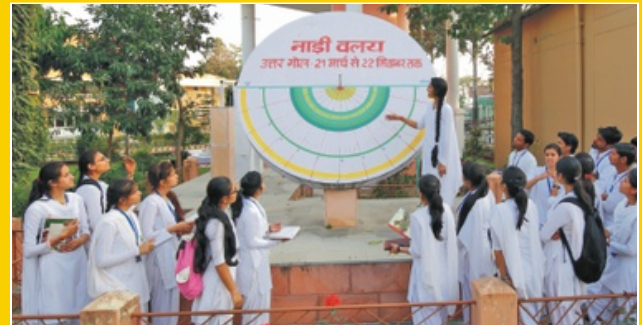
The instruments allow the observation of astronomical positions.