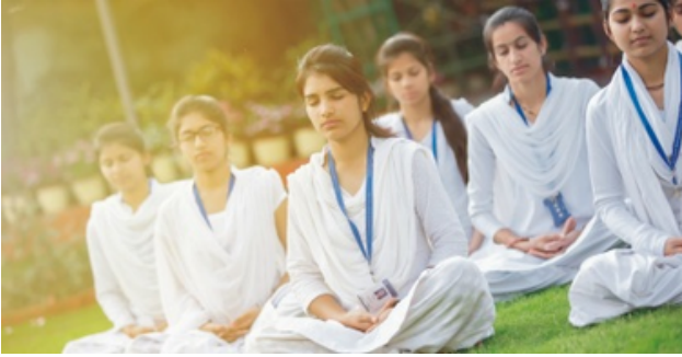
The Triveni of Yoga, Yagya and Meditation bathes the students every day to ensure their holistic development.