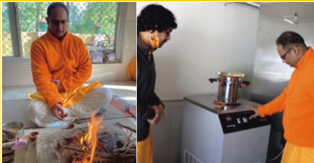
Centre is equipped with modern instruments covering dimensions of Yagya research such as Microbiology, Environmental Science etc.