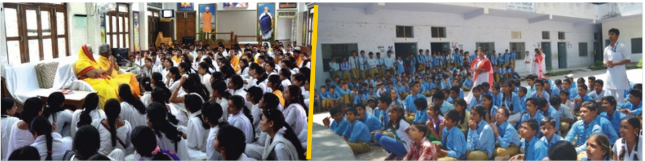
During and after completion of their academic commitments, students contribute in the variety of social upliftment initiatives through internships.