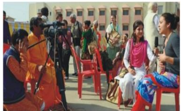
Department of Journalism and Mass Communication