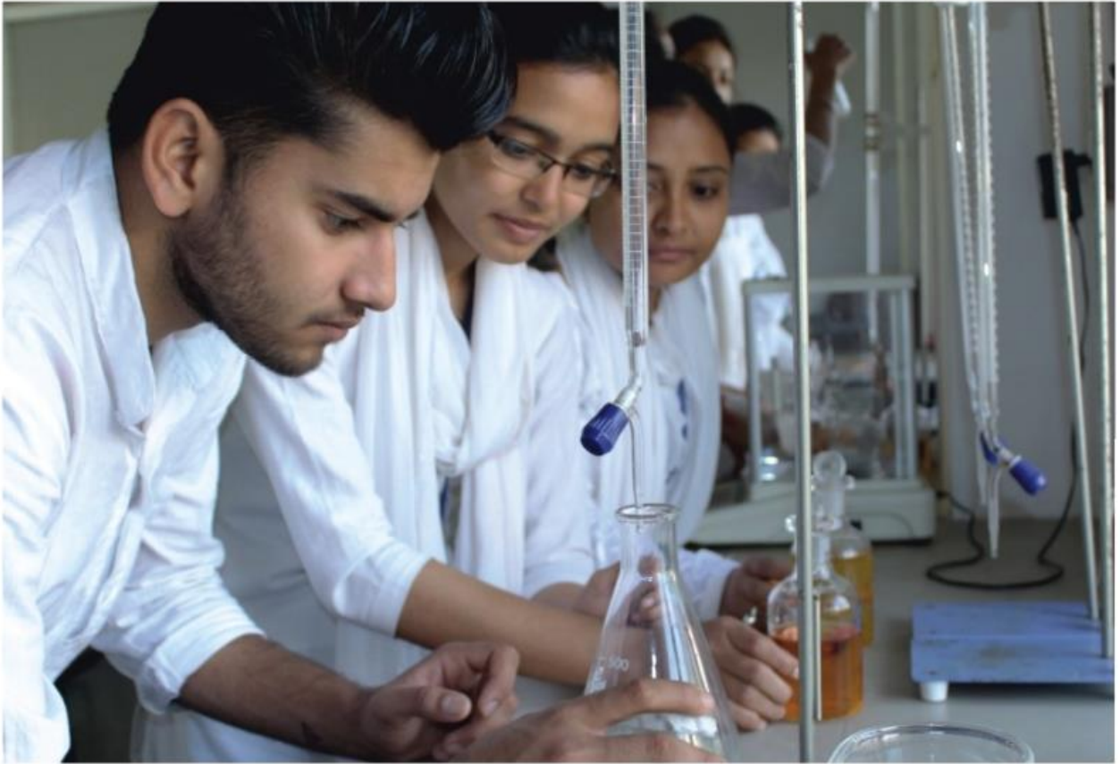
Department of Medicinal Plants Sciences