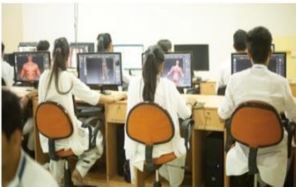
Department of Animation and Visual Effects